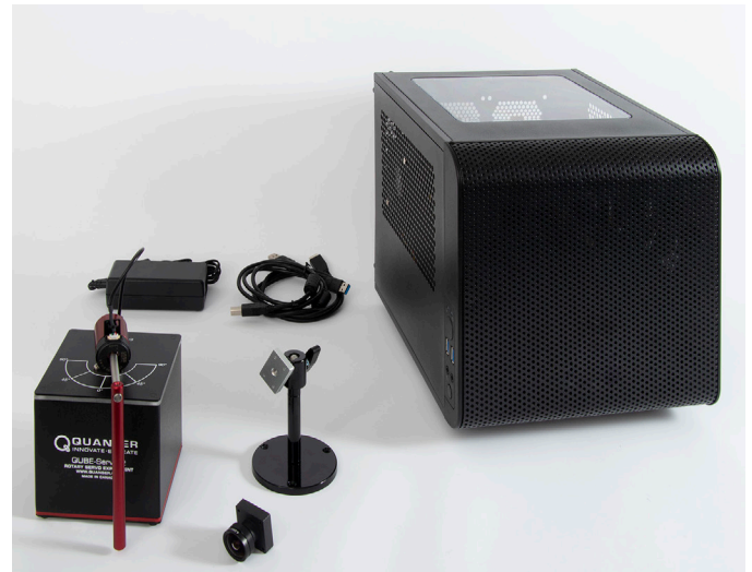
congatec workload consolidation starter kit

With Real-Time Systems Hypervisor, a single CPU can run as multiple, virtual machines for dedicated tasks.